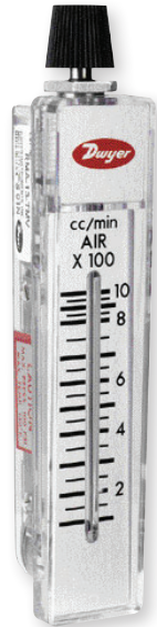
Model RMA-TMV 2" scale, 4-13/16" high