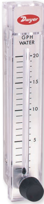
Model RMB-SSV 5" scale, 8-3/4" high