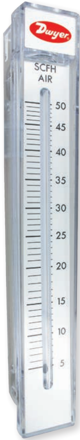
Model RMC 10" scale, 15-3/8" high

2", 5" or 10" Scale, Interchangeable Bodies