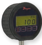
DPG-100 with Protective Rubber Boot